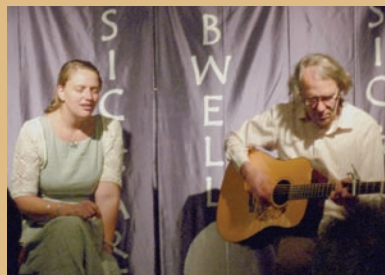
Barnsley (UK) House Concert