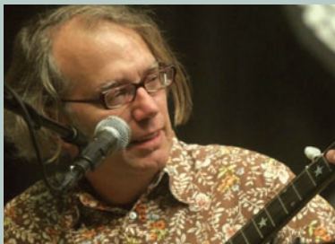
North Wales Bluegrass Festival