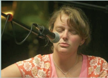
North Wales Bluegrass Festival