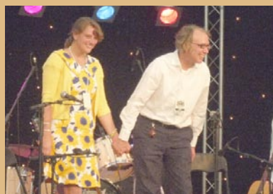
Beverly (UK) Folk Festival