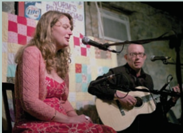
Norm's River Roadhouse, Nashville