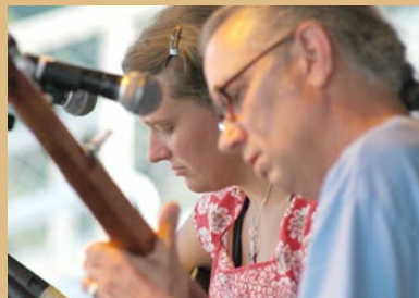
Tazewell County Fiddlers' Convention